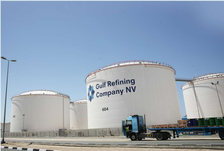
Gulf Refining Co. Jebel Ali, Dubai