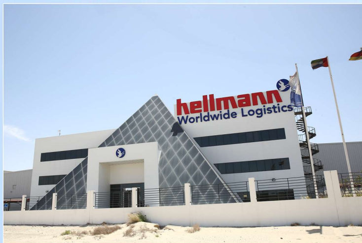
Hellmann Worldwide Logistics Jebel Ali, Dubai