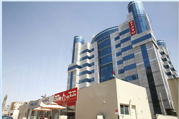
Danube Building Dubai Silicon Oasis, Dubai