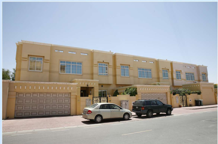
Villa Project Jumeirah, Dubai