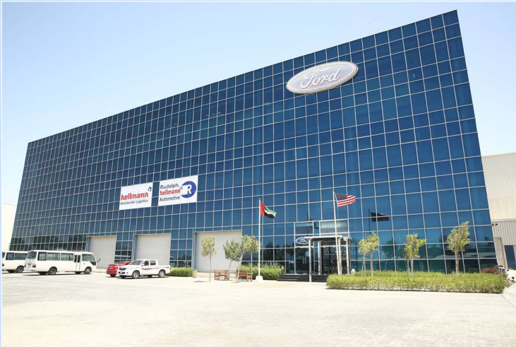
Rudolph Hellmann Automotive Jebel Ali, Dubai